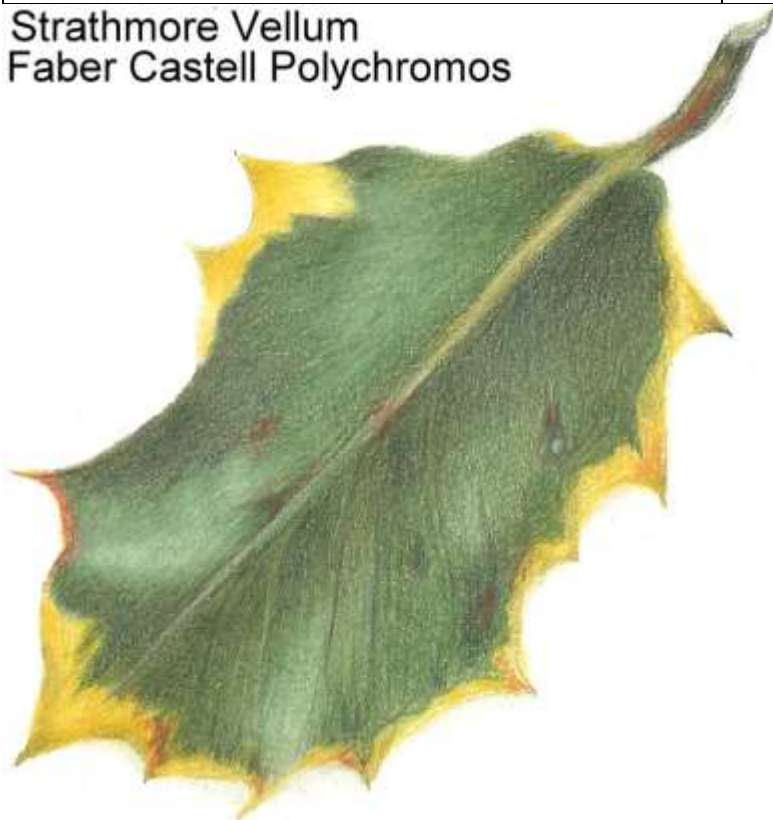
Strathmore Vellum Faber Castell Polychromos